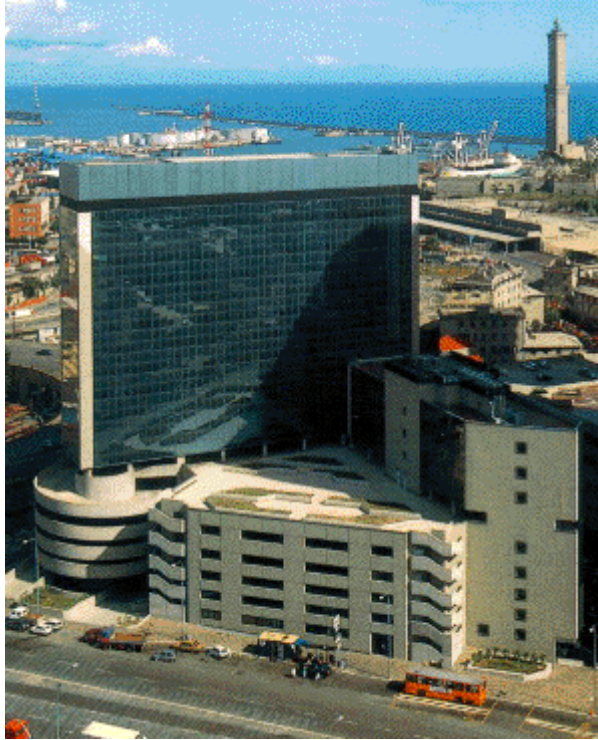
CNR building in front of the FRANCIA 3 BUS stop

Take the BUS NUMBER 20 at the stop V. ROMA/P.ZA CORVETTO, direction Vittorio Veneto. Stop at FRANCIA 3 / STAZ FS. The bus trip takes around 20 minutes.